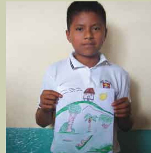
(Left) "House on the Hill" drawing, Rain Tees on the runway (right) of Mercedes Benz Fashion Week.