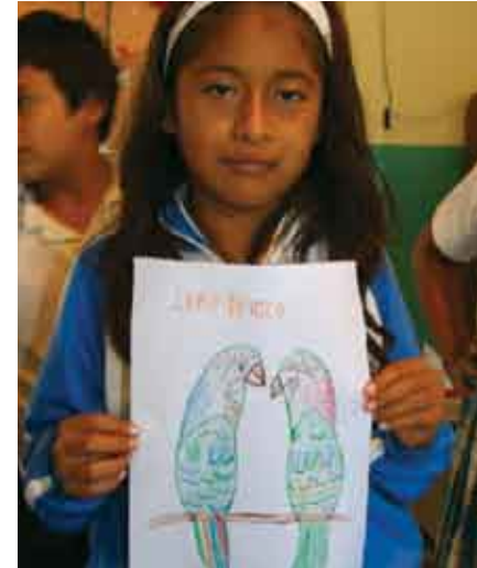
(Left) "loro Perico" drawing, Rain Tees on the runway (right) of Mercedes Benz Fashion Week.