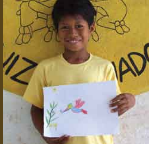
(Left) "Humming Bird" drawing, child with "Humming Bird" Rain Tee.

To share the stories of these children with the world, we print their names, countries, illustrations and thoughts on 100% eco friendly fabrics to create Rain Tees apparel, totes and accessories.