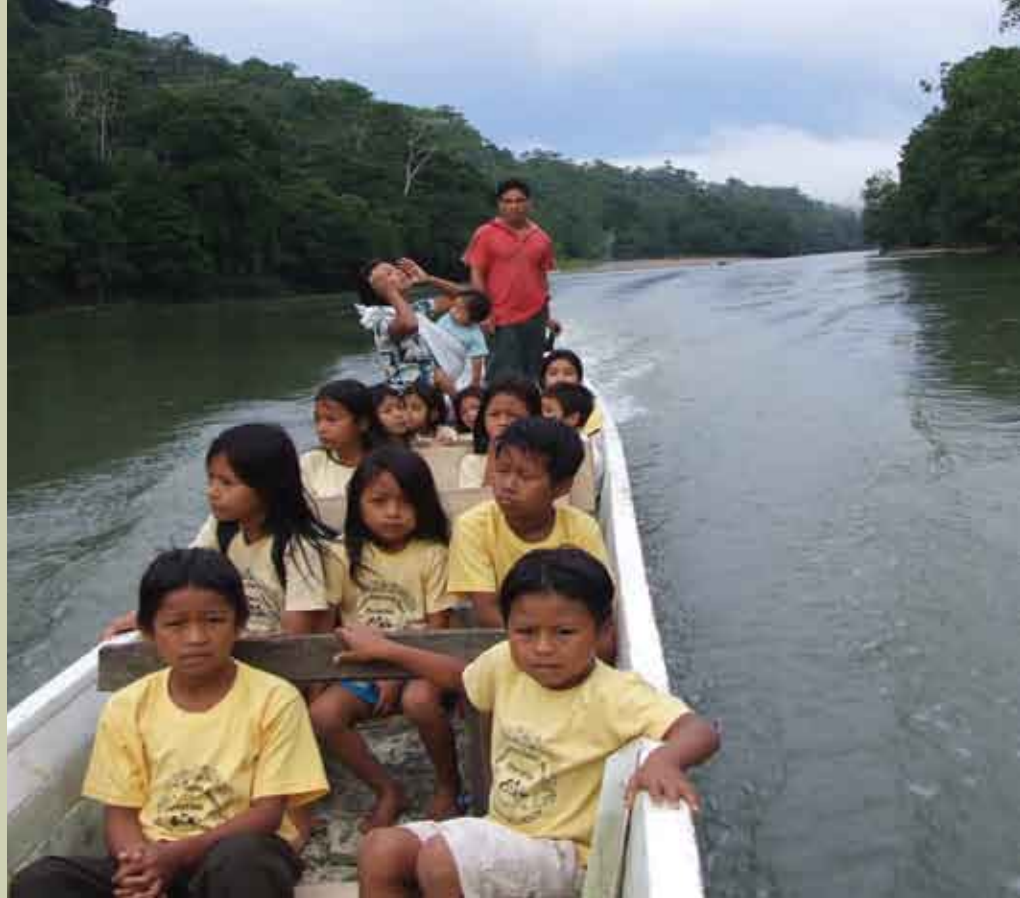
Children traveling down the Amazon River in Ecuador on their local "school-bus".